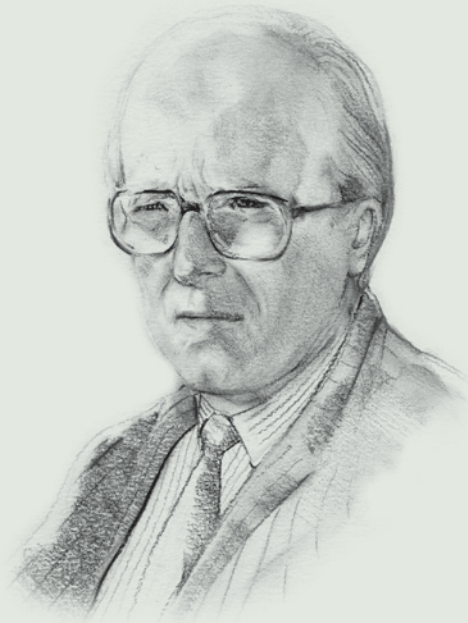
Thomas Henry Bingham ( b. 13 October 1933)

Lord Bingham's distinguished contributions to law are demonstrated by his current appointment as the Senior Law Lord, and by his earlier appointments to the highest judicial offices as Master of the Rolls and as Lord Chief Justice.