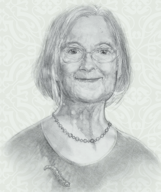
Brenda Marjorie Hale (b. 31 January 1945)

B renda Marjorie Hale, Lady Hale of Richmond is the United Kingdom's most senior woman judge. In 2004, she became the first, and sadly the only, woman Lord of Appeal in Ordinary in the entire 133-year history of the Appellate Committee of the House of Lords, after a varied career as an academic lawyer, law reformer and judge.